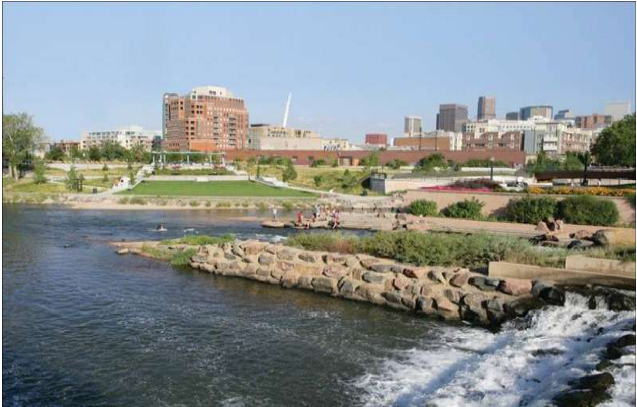
The site is the red brick warehouse above the Park

The Confluence site is next to Confluence Park Plaza on a small rise adjacent to the park and Cherry Creek. The site, at the intersection of 15 th and Little Raven streets, is now occupied by a defunct warehouse. The Speer Boulevard Bridge over the South Platte River occupies a prominent location on the other side of Confluence Park from the site and any development would be highly visible from Speer Boulevard.