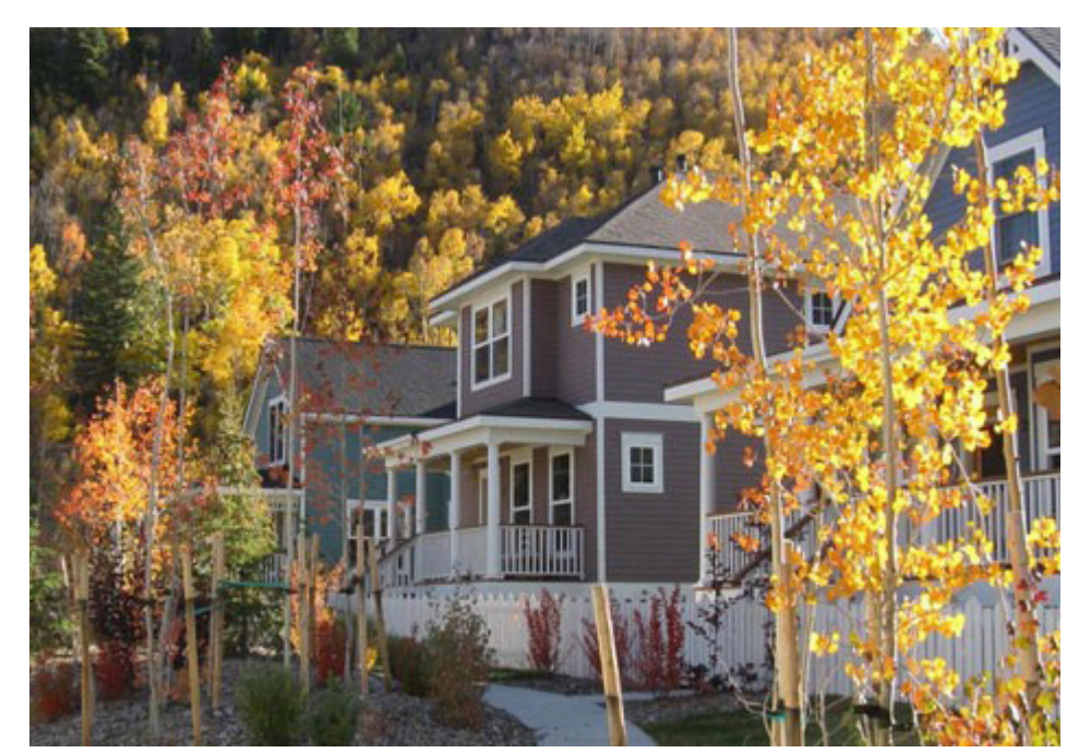
In Breckenridge, the Wellington Neighborhood provides extensive homeownership opportunities on a reclaimed mine only a mile from downtown. The project won the EPA's Smart Growth Award in 2002.

The State of Colorado's LIHTC program "scratches the surface, [but] it's not permanent," he adds. A document recording fee of just $10 would raise as much as $20 million annually, says Miripol, without TABOR ramifications. A transfer tax on all real estate transactions is another possibility, he adds, but TABOR is a big roadblock.