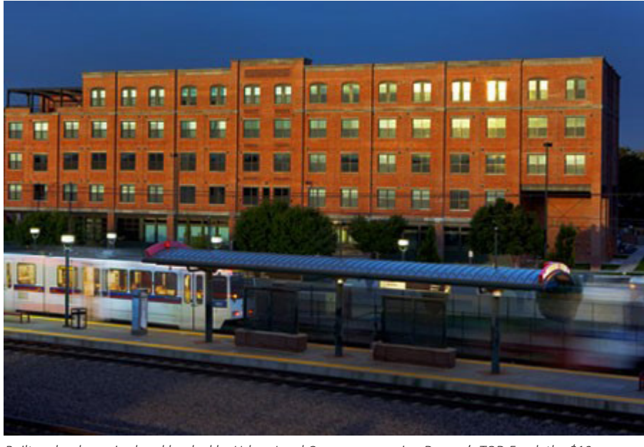
Built on land acquired and banked by Urban Land Conservancy using Denver's TOD Fund, the $12 million Evans Station lofts provides 50 affordable homes with rents starting at $385 a month.

—"In pursuit of the affordable house in Boulder," Daily Camera, August 22, 2016