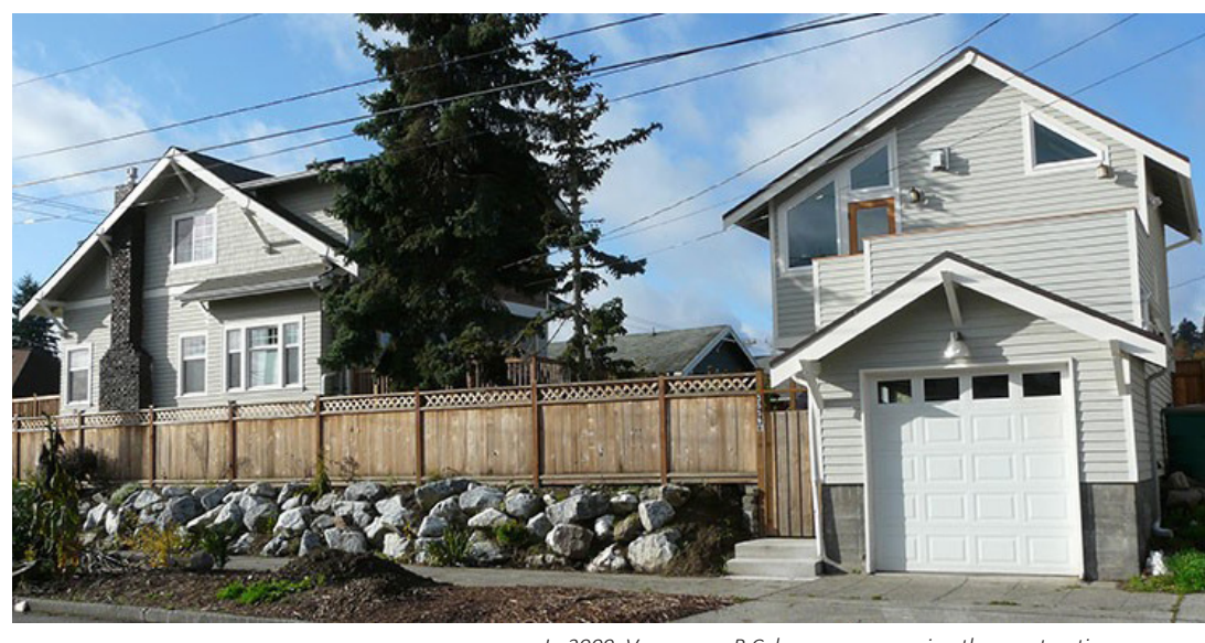
In 2009, Vancouver, B.C, began encouraging the construction of 'laneway' (carriage) houses. Today fully one-third of the city's single-family homes have laneway houses, adding more than 25,000 homes to the housing supply. Homes average 550 square feet and rent for $1,200-$1,800 a month filling a middle-income nook in an expensive market.

ULC has used CLTs for a number of projects and typically leases the land to partners 99 years at a time. "Each deal is different as our intent is to make sure the deal works," says ULC's Miripol. "In most instances, our partner pays us a development right fee – typically at least 75 percent below market value of the land – up front and then pays us a nominal annual ground lease, anywhere from $300 to $2,500 a month based on the size of the development and the value of the land."