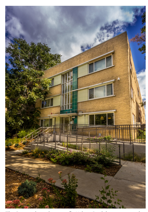
The Denver-based nonprofit Urban Peak has preserved three apartment buildings with 120 units serving at-risk and homeless youth and providing services, job training and employment.