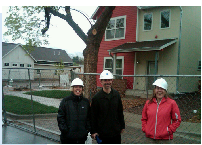
ULI Colorado members tour Red Oak Park before its opening in 2011.

"At the end of the day, we were able to create a beautiful, sustainable, community-centered neighborhood that everybody's very proud of," she says. ULI agrees, and awarded Red Oak Park its Global Award for Excellence in 2012.