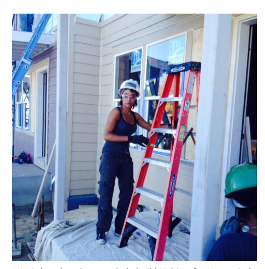
ULI Colorado volunteers help build Habitat for Humanity's first attached housing in Denver's Montbello neighborhood.

According to U.S. Census estimates, more than 100,000 people moved to Colorado in 2015 while builders added only 25,000 homes to the housing stock. Roughly 40,000 homes would have been necessary to match the influx of new residents for 2015 alone.