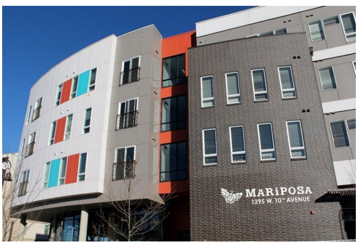
Denver Housing Authority's nine-phase, $150 million Mariposa project is transforming a dangerous, unsightly public housing project into a healthy, mixed-income neighborhood next to a light-rail station.