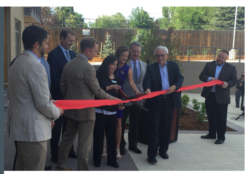
Private developers and public officials celebrate the dedication of new affordable housing at Yale Station in Denver's 119-mile FasTracks transit system.

Cash in lieu: Instead of building affordable homes on-site, many IHOs allow developers to pay cash to the municipality to fund development of affordable housing elsewhere in the jurisdiction.